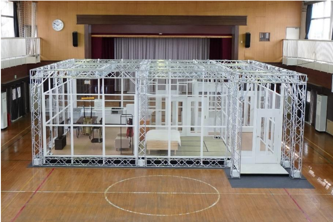
Panoramic view of contest field